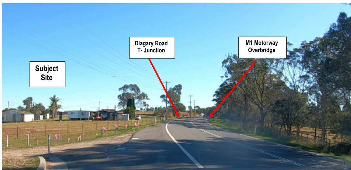
Figure 4 (Looking west)

In the vicinity of the site Hue Hue Road operates as a two-lane two-way road, within a road reserve approximately 20 metres wide accommodating 7.0m wide bitumen sealed roadway with partially bitumen sealed shoulder on both sides of the road and grassed footways (refer Figure 4).