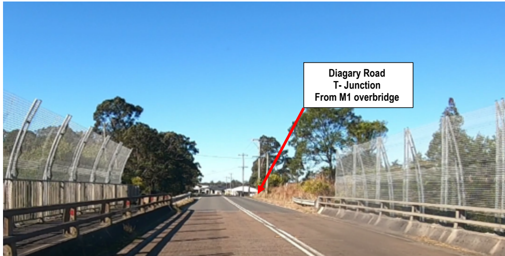
Figure 5 (looking east toward Diagary Road)

In the vicinity of the site Hue Hue Road is generally on a straight horizontal alignment and the proposed Diagary Road vehicle access road located on a slight crest vertical curve. It is recognized the widening of Hue Hue Road, along the frontage of the site and Diagary Road refurbishment/ construction will need to be a “consideration” for development requirement of the proposed planned residential subdivision and to this end adequate design vehicle safe intersection sight distances (SISD) in accordance with Austroads Design Guides are available along Hue Hue Road at Diagary Road.